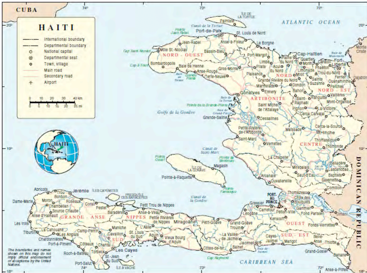
Map No. 3855 Rev. 4 UNITED NATIONS. June 2008. Department of Field Support. Cartographic Section.