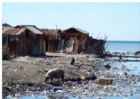
Cité Soleil, a slum in Port-au-Prince, Haiti