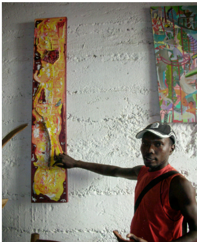
A Jacmel-based Haitian artist described his vision for the future of Haiti: A rich, complex country, with turmoil violence, and challenging conditions. But the future holds hope and promise, represented by the small bulb of light pasted into his collage.

reproductive health services have suffered from many of the resulting service gaps. Investments made not only in quality service provision, but also in capacity building for local actors, will help advance priorities to reduce maternal mortality, gender-based violence, HIV, and increase family planning. In a context where political violence, natural disasters, economic deterioration, insecurity, and health are so intertwined, investments in a local and holistic approach is needed to address the needs and struggles of many Haitian women and families.